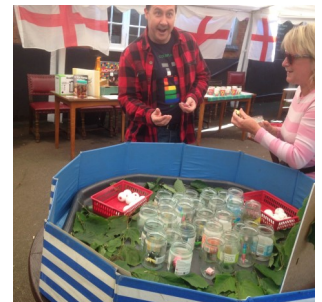
Jam Jar Jungle