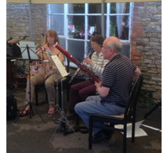
The 'Olney Trio'