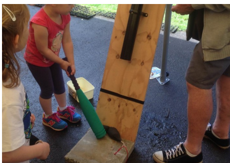
Splat the Rat (nearly!)