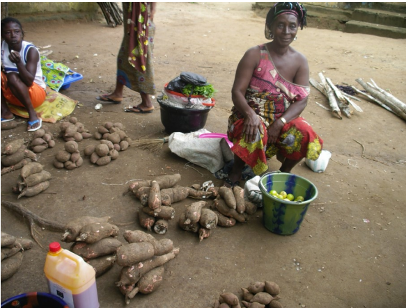
Cassava and Yams provide carbohydrates