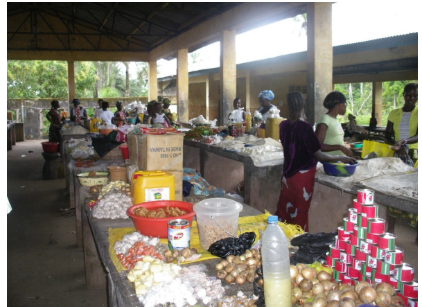
The indoor part of the market—vital in the rainy season