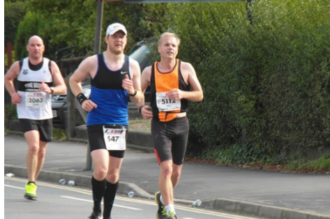
Tough going. Just after 25 miles as they reached the biggest hill on the course.