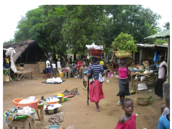
A long walk home with a heavy load.