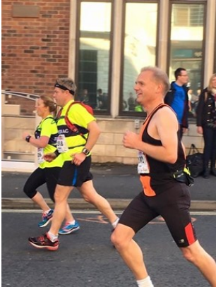
A cheerful start