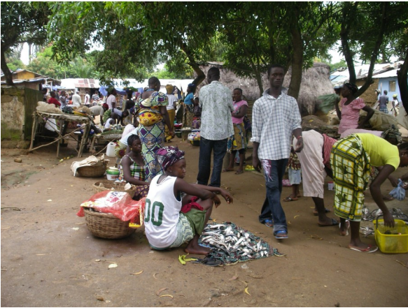
Dried fish is a vital part of the diet

These photographs were taken at the market in Newton.