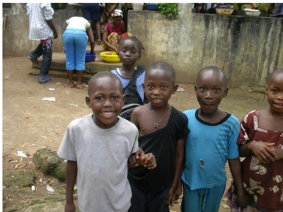
Friendly faces—"Snap me!"