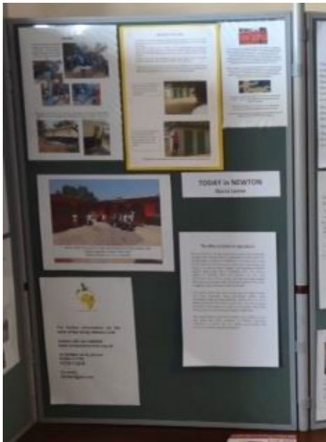
Newton—The Skills Centre

The Olney Newton Link has put up a display at the Cowper and Newton Museum, showing what life is like in Newton today.