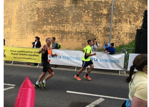
The Finish line.