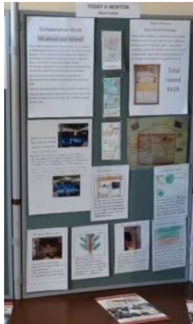
All about the schools...