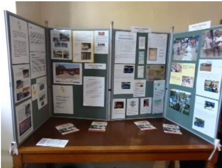
The ONL display at the museum — we hope you saw it

Black History Month is an annual observance for the remembrance of important people and events in the history of the African diaspora. It was first celebrated in the United Kingdom in 1987.