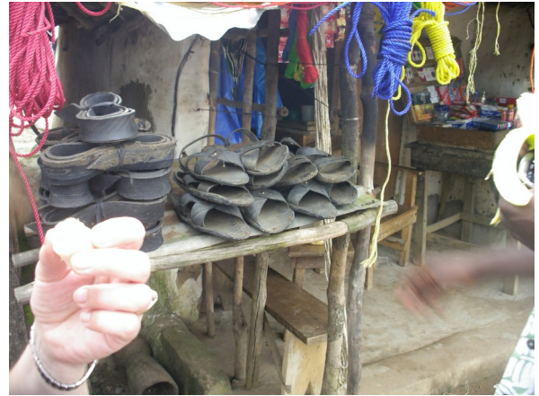
Shoes are made from old tyres