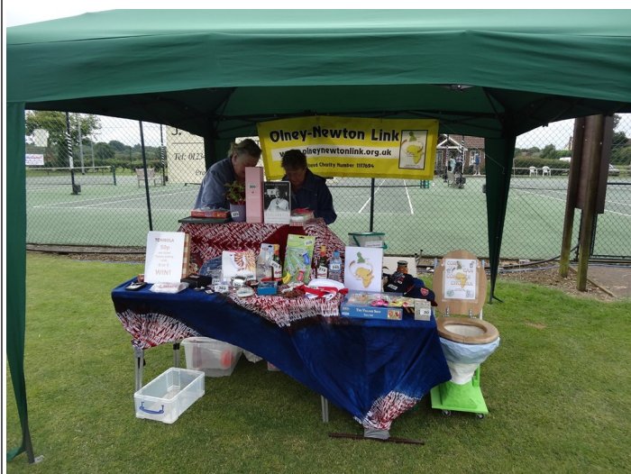
The Cherry Fair