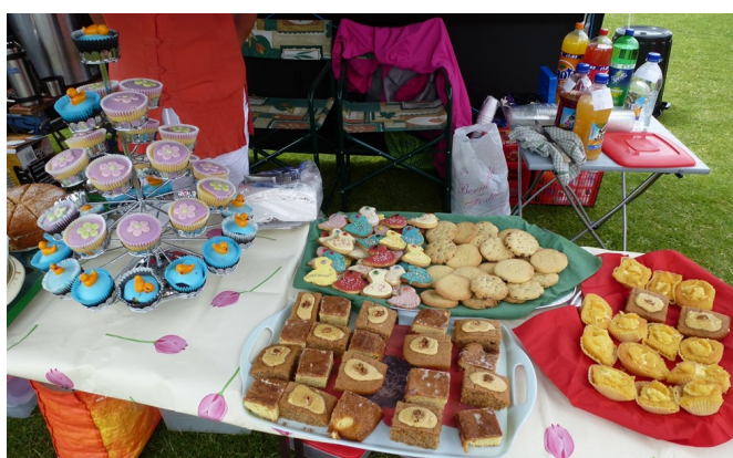
The wonderful cakes at The Raft Race

And then we were invited to take the tombola to the Olney Colts Awards Presentation next day, just a few fields further along. The weather was better (just drizzle) and luckily the heavy rain held off until clearing up time.