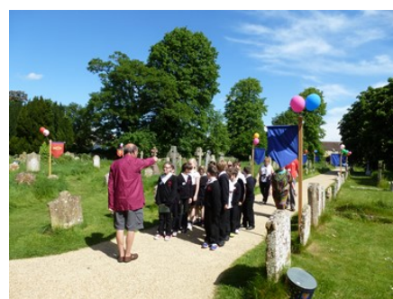
Lining up for school