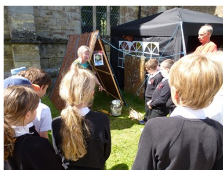
Preparing the fire and food