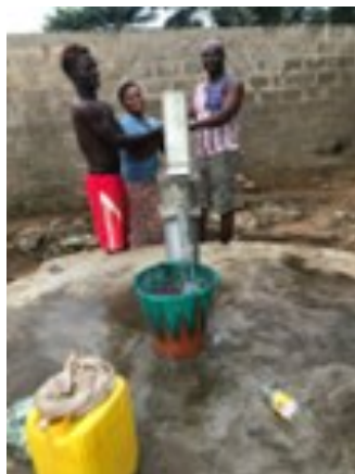
First repair site Nyandehun Newton